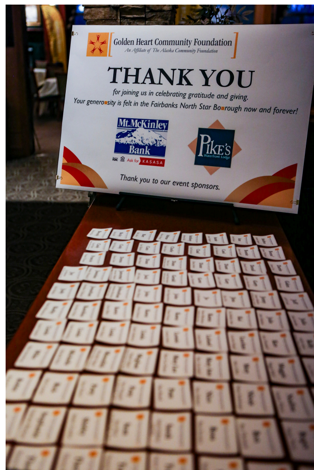
The wonderful buffet was enjoyed by our guests, courtesy of Ursula Gottschling