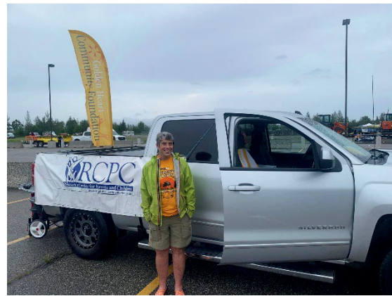
RCPC carried our banner in the Golden Days Parade

I came away so impressed and proud of these hardworking nonprofits and of being part of a foundation like GHCF that supports them.